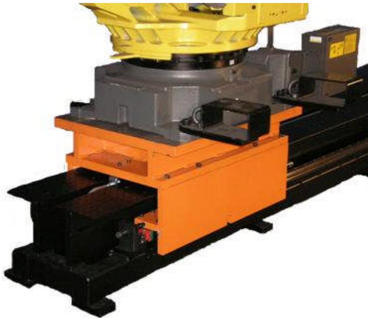
Shuttle Mount Shown