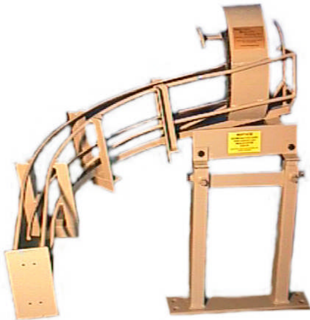
Waterfall, Curved Gravity Rail Track Shown