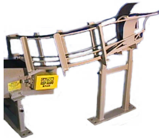
Waterfall, Curved Gravity Rail Track To Take-away Conveyor Shown

Allow increased production. Can control part orientation. Economical automation. Eliminates hazardous manual handling. Helps ergonomic considerations. Reduces manual labor.