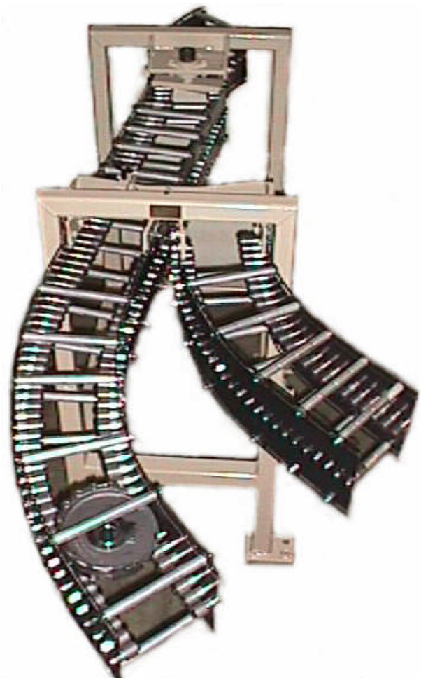
Split Gravity Roller Curved Shown