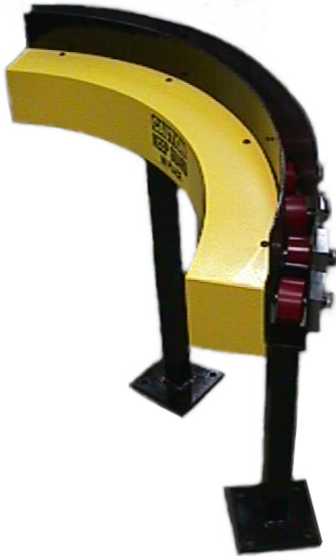
Slave Chain Driven Section Shown