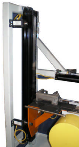
Carrier Raised Position Carrier Mid Position Carrier Lowered Position