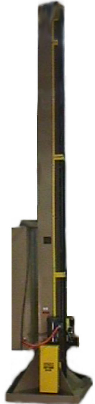
Cleated Vertical Chain Elevator Shown