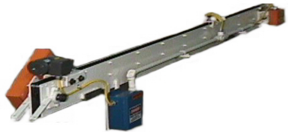
Silent Chain Conveyor Shown

Wide range of Chain materials available from Roller Chain, Attachment Chain, Steel (Table Top), Stainless Steel, Silent Chain, Plastic, Mat Top, and more. Drive motors for 90 VDC, 120 VAC, 220 VAC, or 460 VAC operation. Motion Detector Package to read belt movement. Bearing Guarding Packages to encase front and take-up flanged bearings. Fixed height or H-Style adjustable floor support legs.