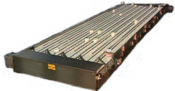
Accumulation Conveyor Shown