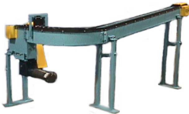
Side Flexing Conveyor Shown