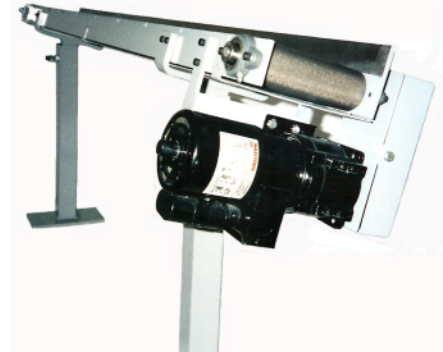
Tilted Pack-out Conveyor

Custom designed and built to suit your requirements. Utilize when off the shelf conveyors will not work. Covers a wide range of parts that can be handled. Can handle parts in bulk as well as contained part flow. Used to remove parts from machining processes. Drive packages can be continuous running or indexing. Flat running or inclined belts.