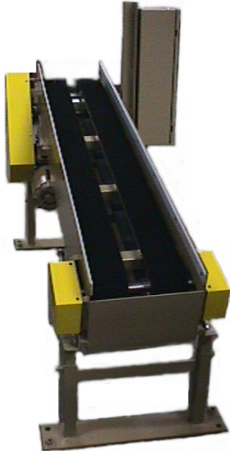
Split Belt Conveyor