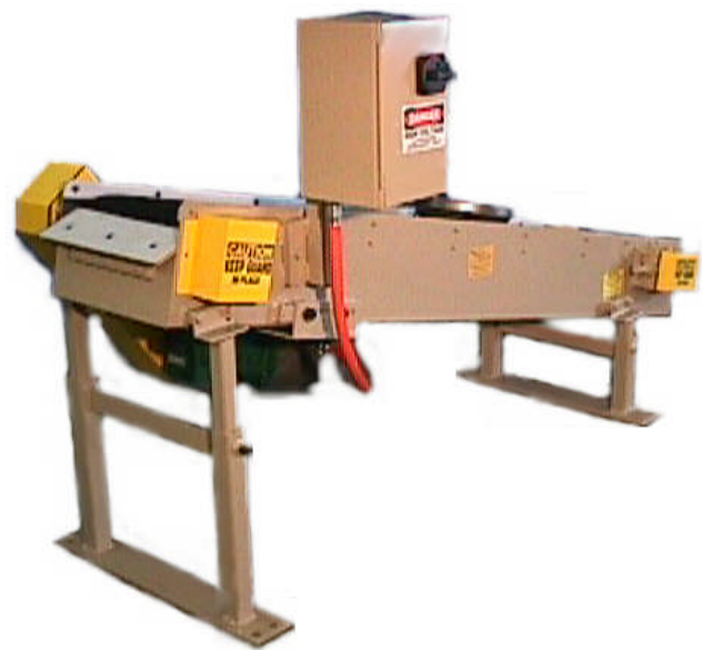
Inclined Rough Top Conveyor with Disconnect Starter Box