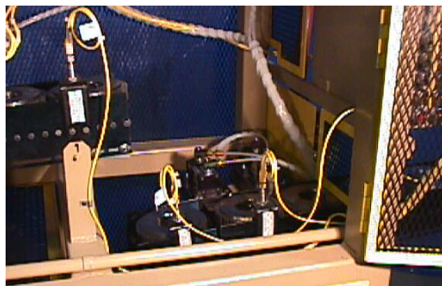
Part Vertical Lift Unit Shown