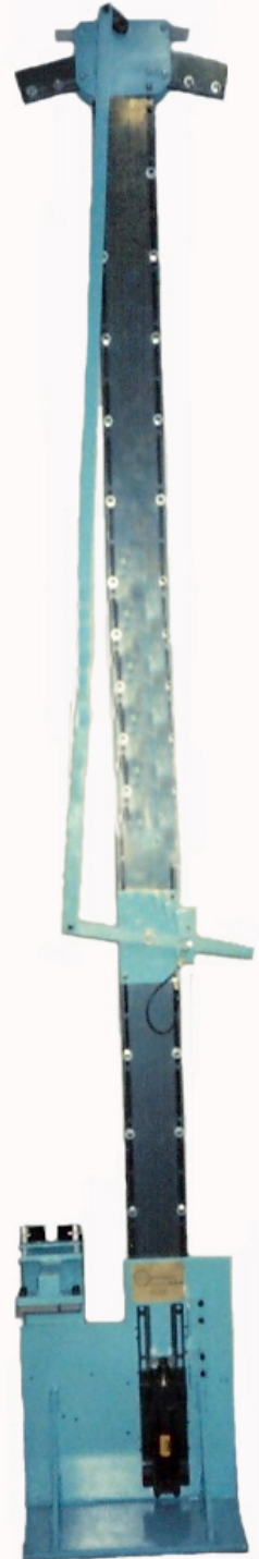
Pump-Up Back Unit with Dual Manual Discharge Gate Shown