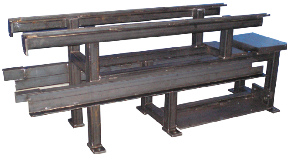
Frame Weldment Shown

Coatings from Black Oxide, Chrome, Zinc, Hard Coat, Hardened, and Anodizing of your color specifications.